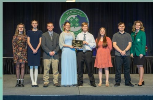
Together Everyone Accomplishes More (TEAM) Award- Warren County 4-H Leadership Club