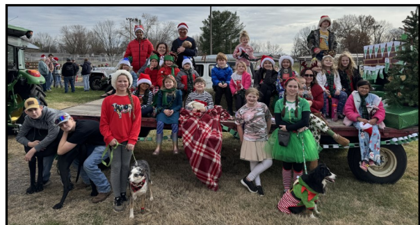
Top Dog & Cloverbud Clubs

Congratulations to the following clubs who prepared parade entries to promote 4-H and their clubs: The Horse Club participated in the Bowling Green Christmas Parade and received the Judge Executives Award. Cloverbud and Top Dog 4-H Clubs participated in the Woodburn Christmas Parade. The Cloverbud Club received 2 nd place in the float division. All of these clubs did an excellent job! Check out their pictures: